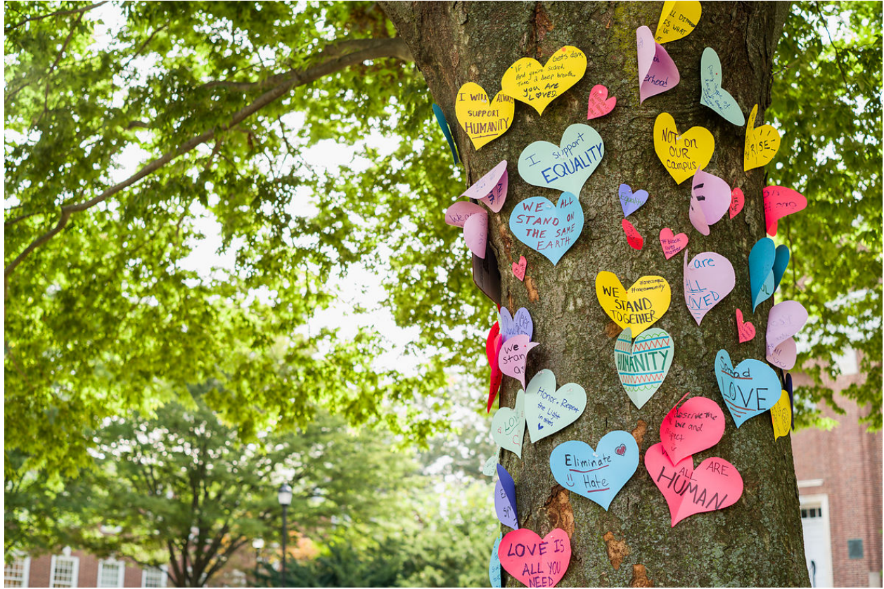
Tree on the UD campus with messages pinned to it, after campus meeting, September 25, 2016