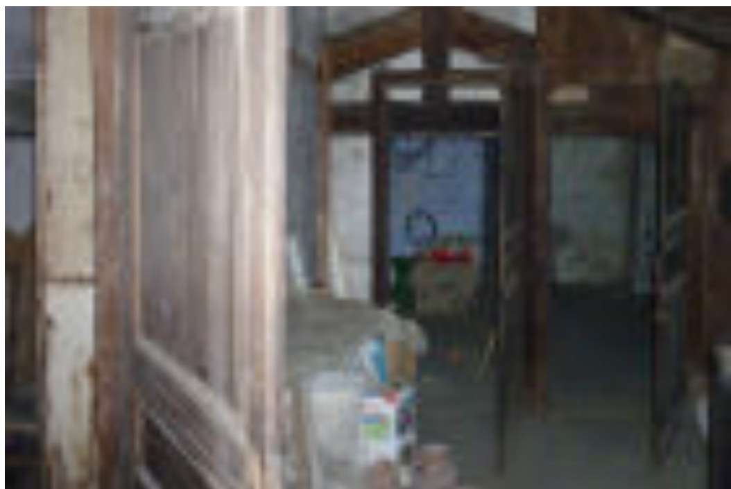
The Toulouse attic where the painting was found.