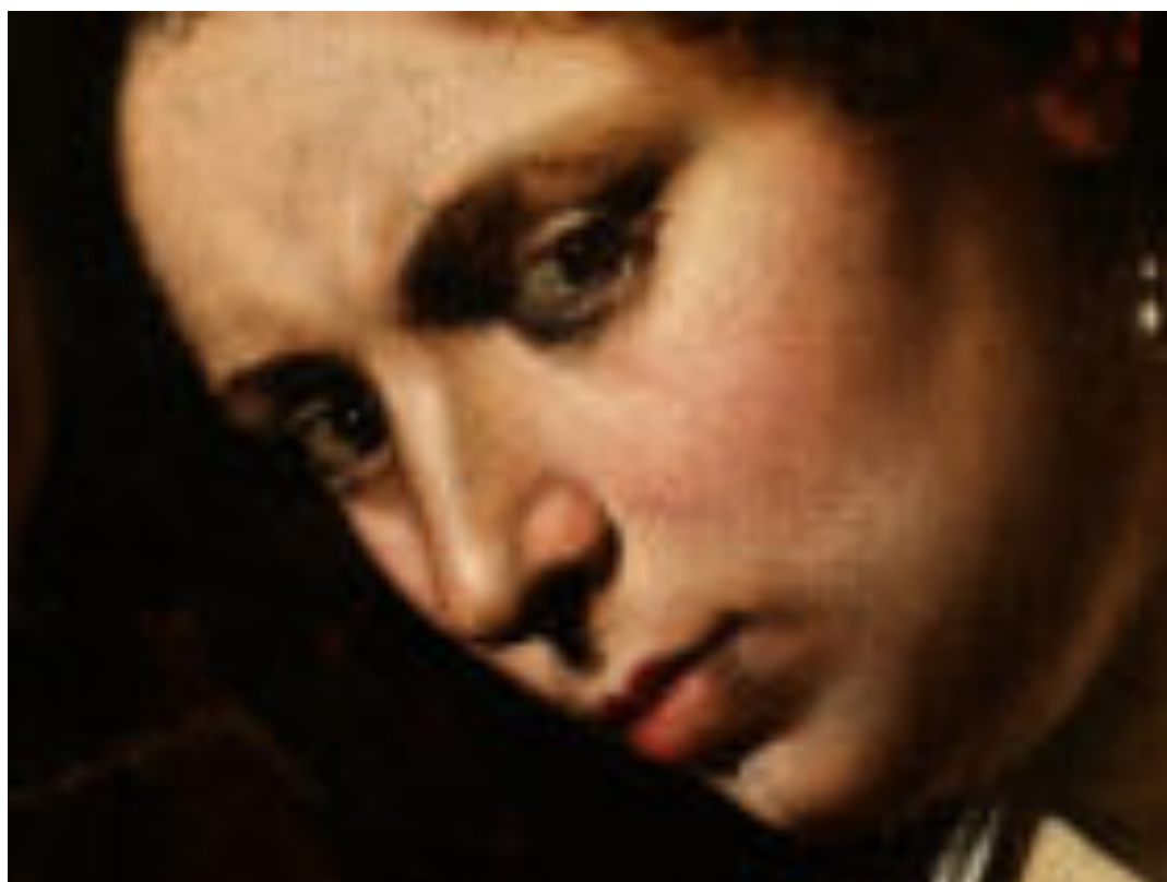
A closeup of Judith in the painting "Judith and Holofernes."